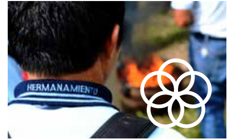
Town partnerships (hermanamientos) are a nice example of a global alliance.

The city council of Genk decided to focus on a more sustainable city organisation from 2014. The sustainability officer was asked to work on a comprehensive interpretation of the sustainability concept. Firstly, he defined and discussed this concept with colleagues from various city departments, the management team and the board of mayor and deputy mayors. With the guidance of VITO, the transition started. A transition learning group was set up with colleagues from the departments for community development, participation, policy planning, sustainability and environment. A TRAKSIS information session was held for all project coordinators of the 60 horizontal projects in the Genk multiannual plan. Six project coordinators scanned their projects with TRAKSIS, a tool that supports cities in their transition to sustainability. Two master classes (about systems thinking and visioning) were organised for all city administration colleagues. At the end of 2015, the council took some time to reflect, learn some lessons and refine the focus of the learning process.